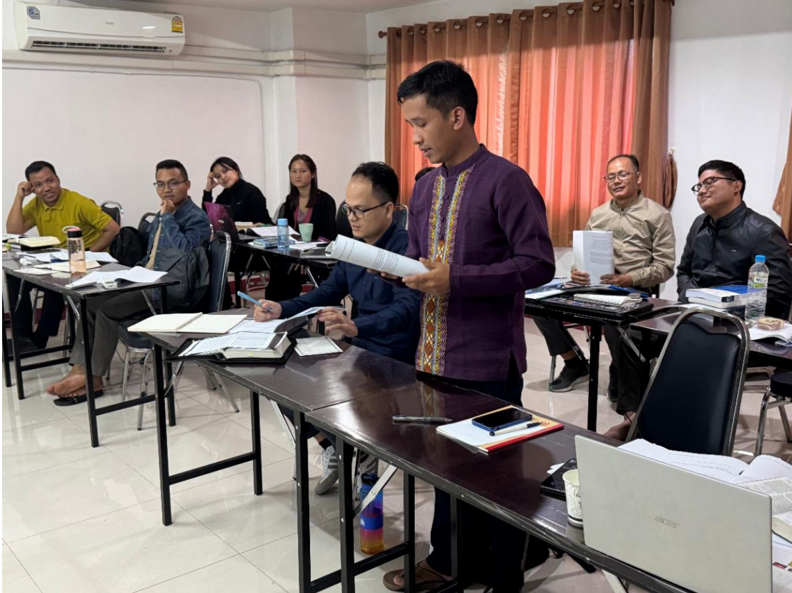
Master of Theology student reading his translation of a verse in Greek

I also wish you could have met the 10 students and one faculty member from Myanmar Institute of Theology (MIT), who flew from Yangon to study the book of Philippians with me in Chiang Mai. The week exceeded everyone's expectations (which were already quite high). When they arrived, I could see so much pain in their faces, but as the week went on, their eyes softened, and bit by bit, joy emerged. By the end, according to the Dean of Students, who wrote to me afterwards, the students were gushing with gratitude and appreciation. He wrote: