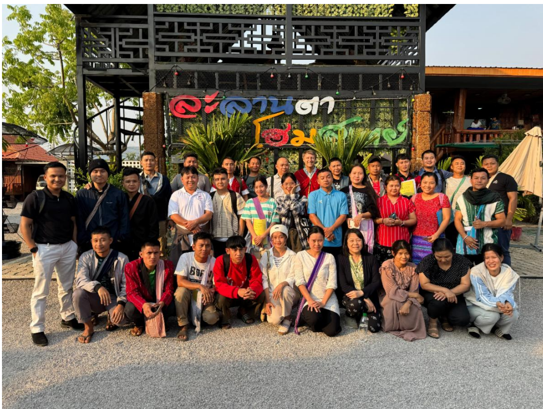
Kawthoolei Hope Theological Seminary (KHTS) Graduates celebrating the "Spiritual Strength under Stress" seminar