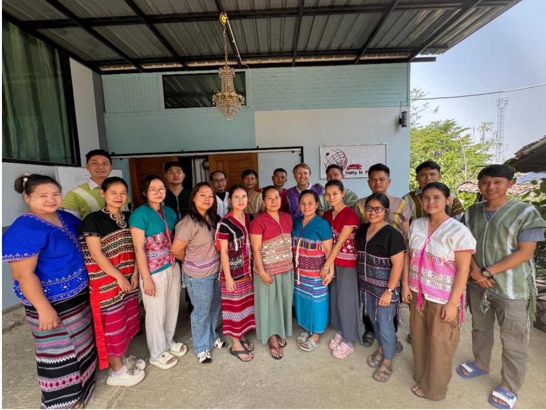
KKBC Bible School Teachers

I cannot overstate the tremendous value of these kinds of seminars for the refugees, especially for those who serve as community leaders, ministers, and teachers in the Bible schools. This is not me saying they need it. It's them saying, verbally and nonverbally, over and over again, "We need and want to learn more about God, to be better educated, and to know how to apply the spiritual truths of the Bible to our personal lives and communities more effectively."