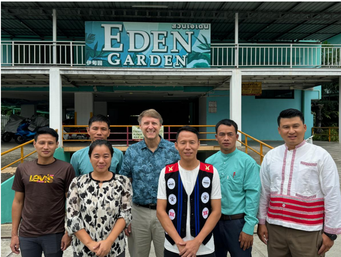
Master of Theology Biblical Students from MIT